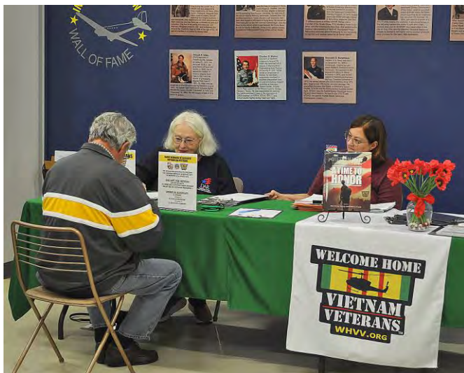
An event was held for all Vietnam veterans sponsored by the Welcome Home Vietnam Veterans Organization.