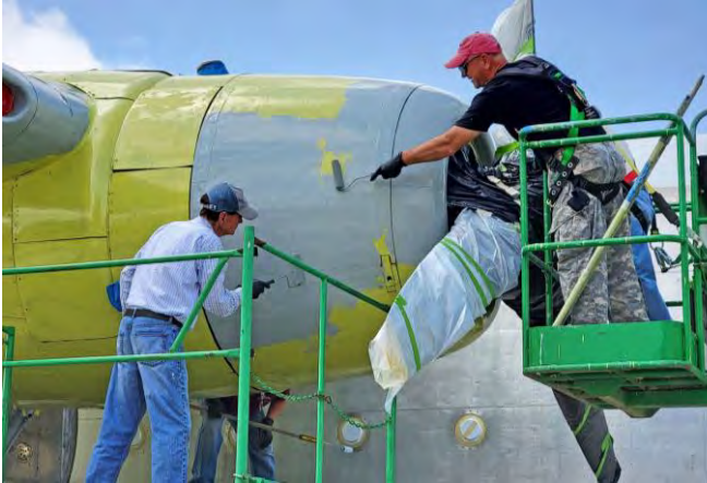
The restoration team resumed their work in May with the return of warm and dry weather.