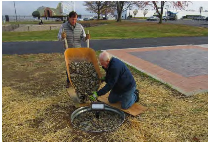
Exterior flood lights were placed around the airplane.

The Restoration Team continued to work on the C-119 after the dedication ceremony.