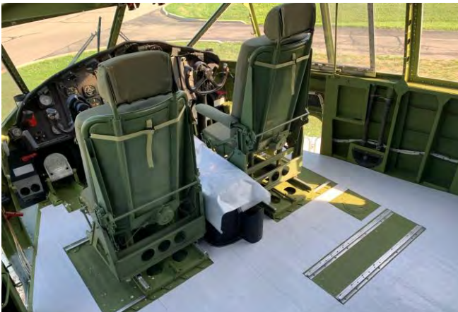
The restored seats were reinstalled in the cockpit.