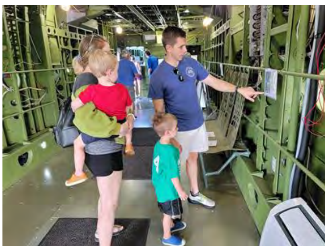
Signs explained some of the unusual features of a military transport, and museum volunteers were available to answer questions.