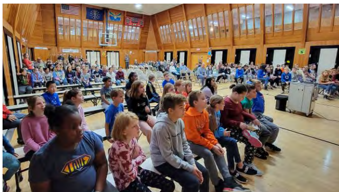
A presentation was given to 150 children in K-3 rd grades. This was followed by a second assembly for the 150 children in 4 th - 6 th grades.