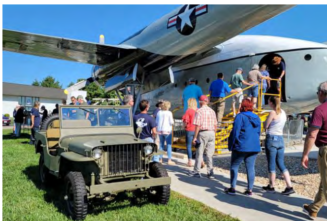
The interior of the airplane was open to visitors.