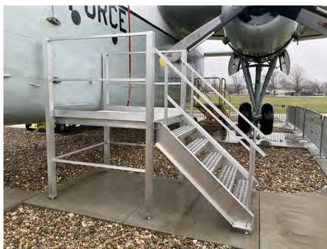
The temporary, wooden, stairs were replaced with permanent aluminum stairs. These stairs were constructed by Central Sheet Metal of Columbus.