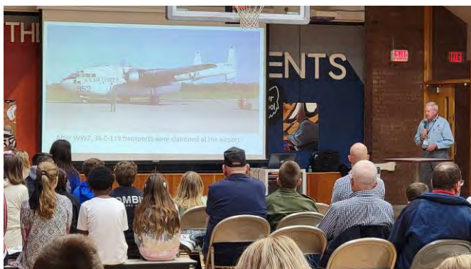
Museum volunteers visited Lincoln Elementary School in Columbus on Veterans Day.